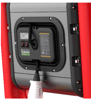
Cable management system